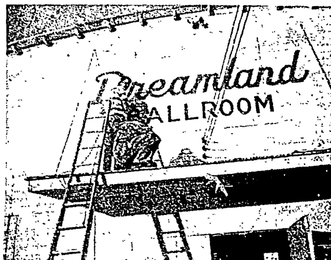
Painting the Dreamland Ballroom was one of the many community projects completed this year by the Postville Jaycees.