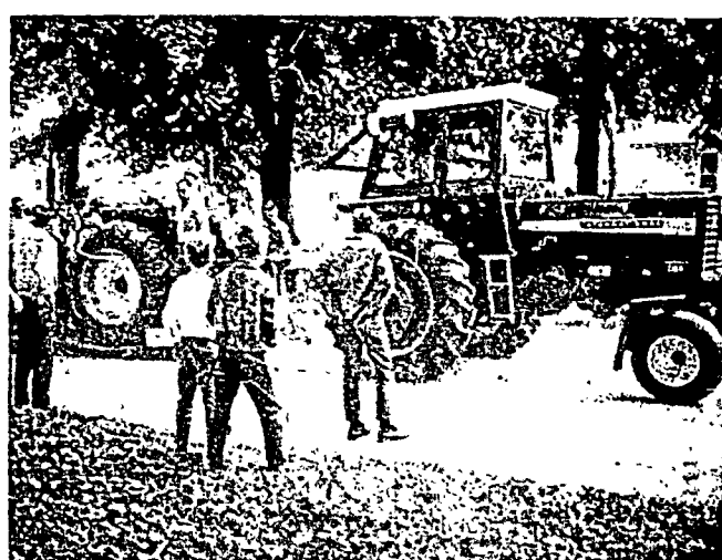
The Tractor Pulling Contest provided a lot of fun for both the contestants and spectators.